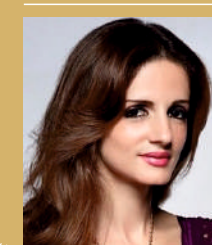
Interior by SUSSANNE KHAN